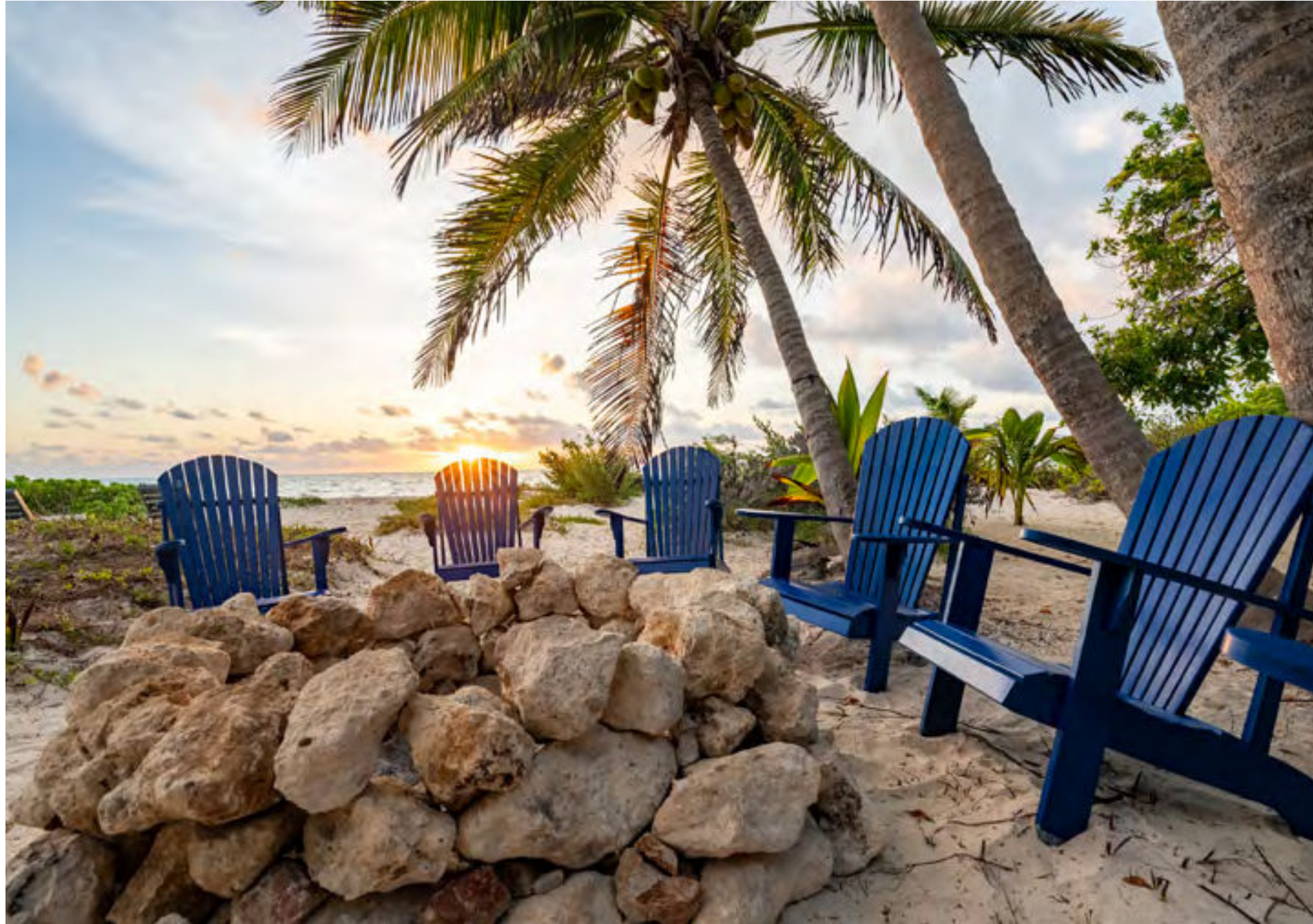
Picture yourself relaxing here after an exciting day of fishing. In the background, salt water. In the foreground salt on the rim of a cool drink.