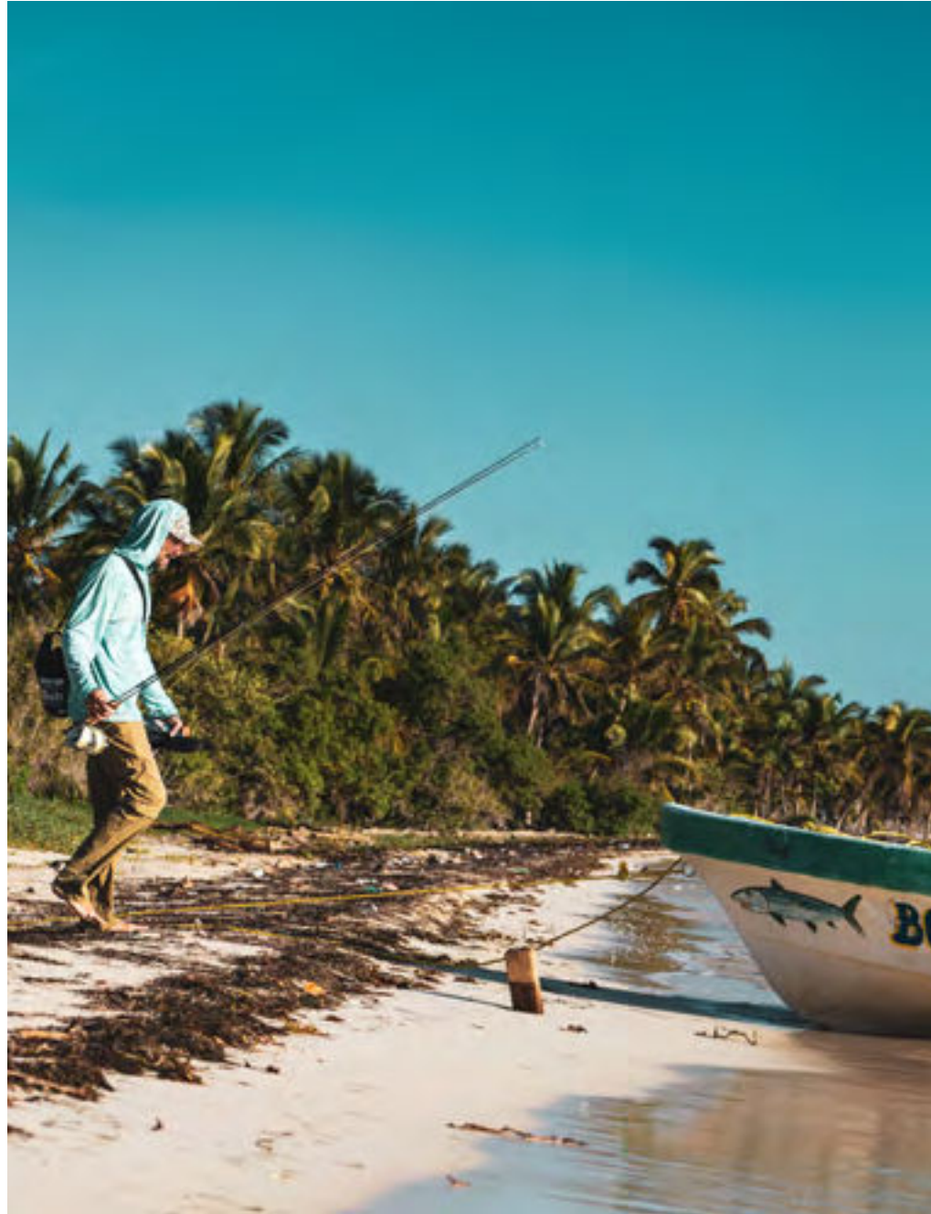
Comfortable pangas-Permit landing craft- are beached right near the lodge. No bumpy roads. No wasted time trailering.