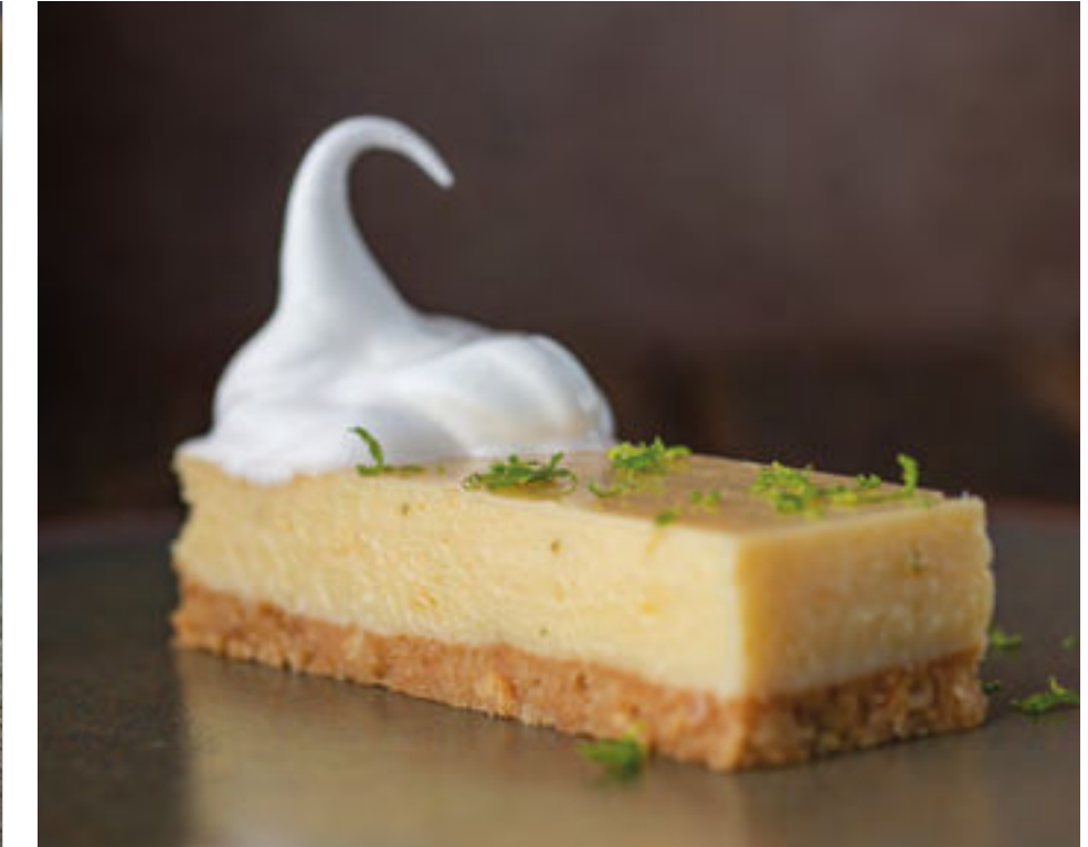
Key Lime Pie