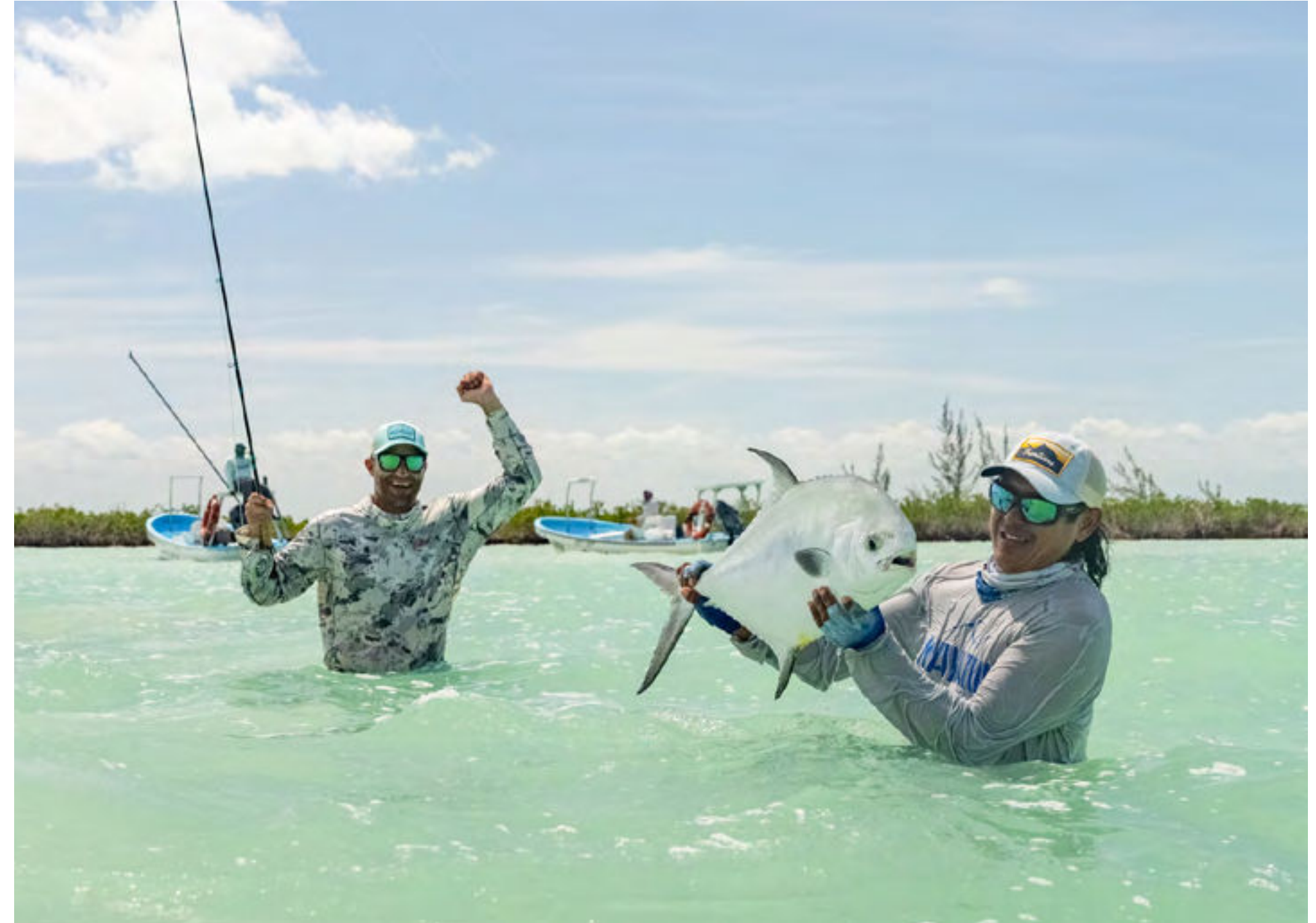
A big permit in hand—the final product of dreams, planning, work, luck, and clean living!