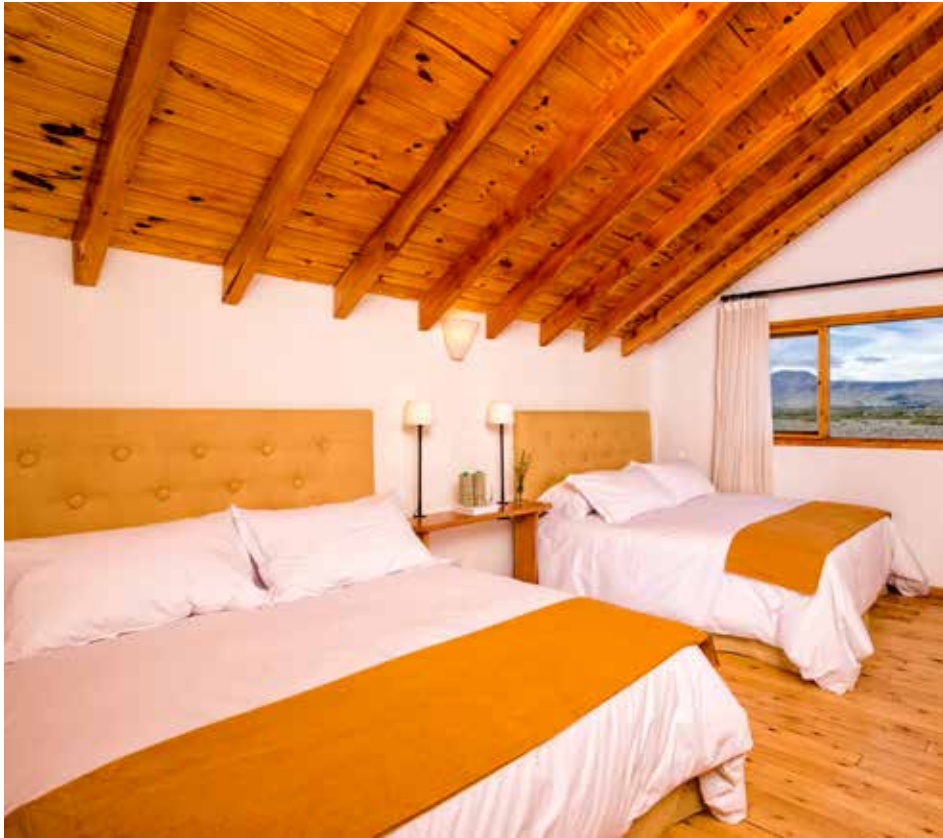
5 Double Rooms with 2 queen size beds.