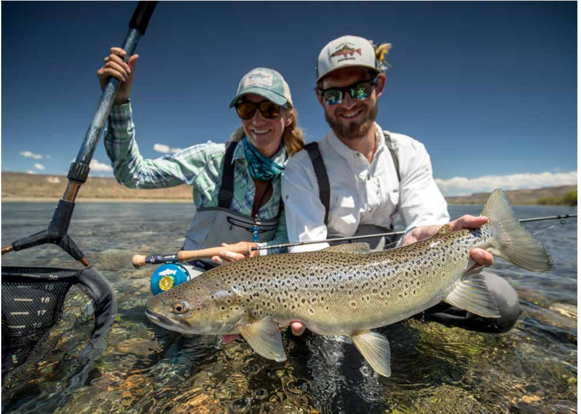
Chime Lodge boasts front-door access to the greatest diversity of trophy brown and rainbow trout waters.