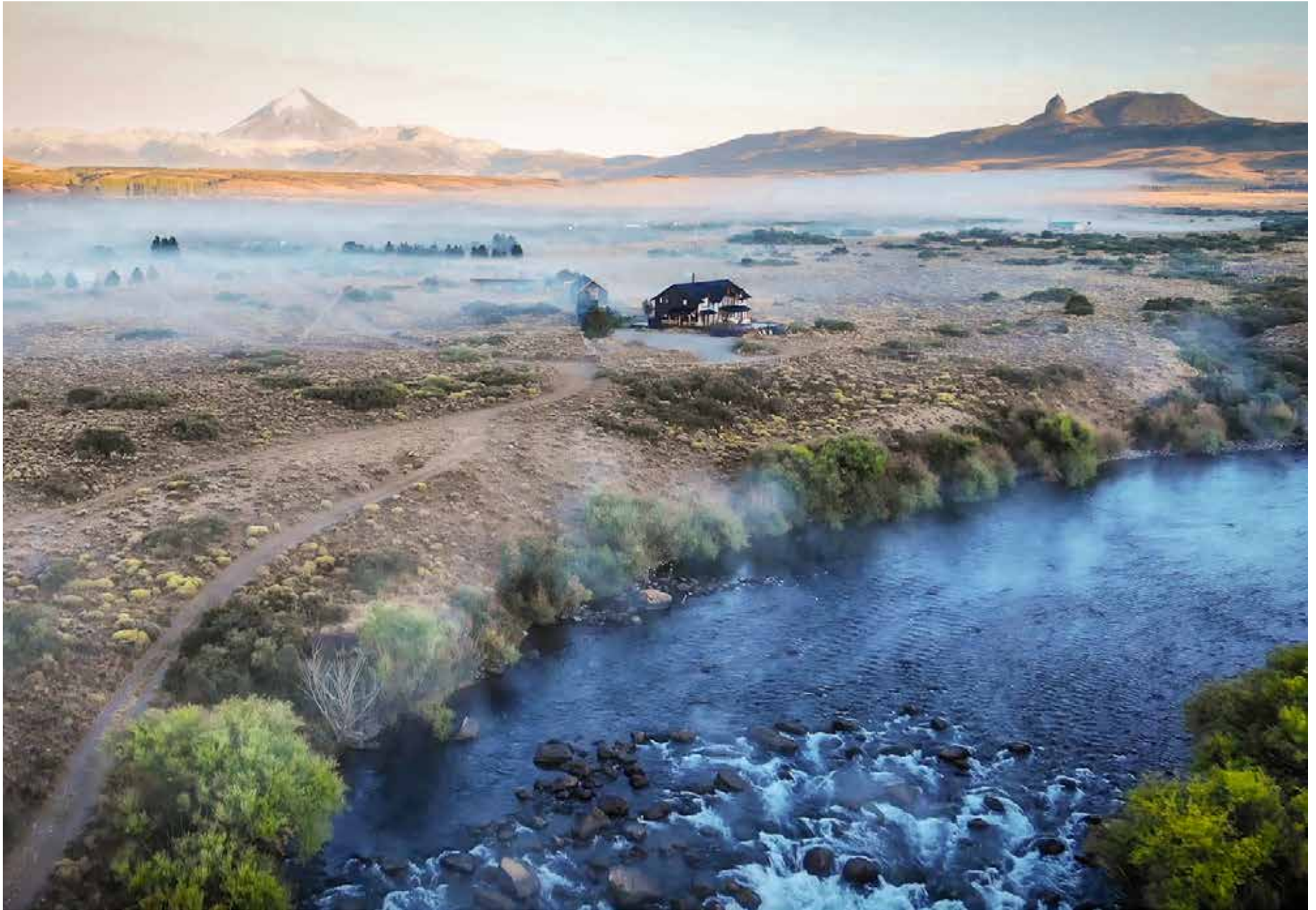
Nestled on the shores of the idyllic Chimehuin River, Chime Lodge's location makes it a strategic hub for traveling anglers from around the world.