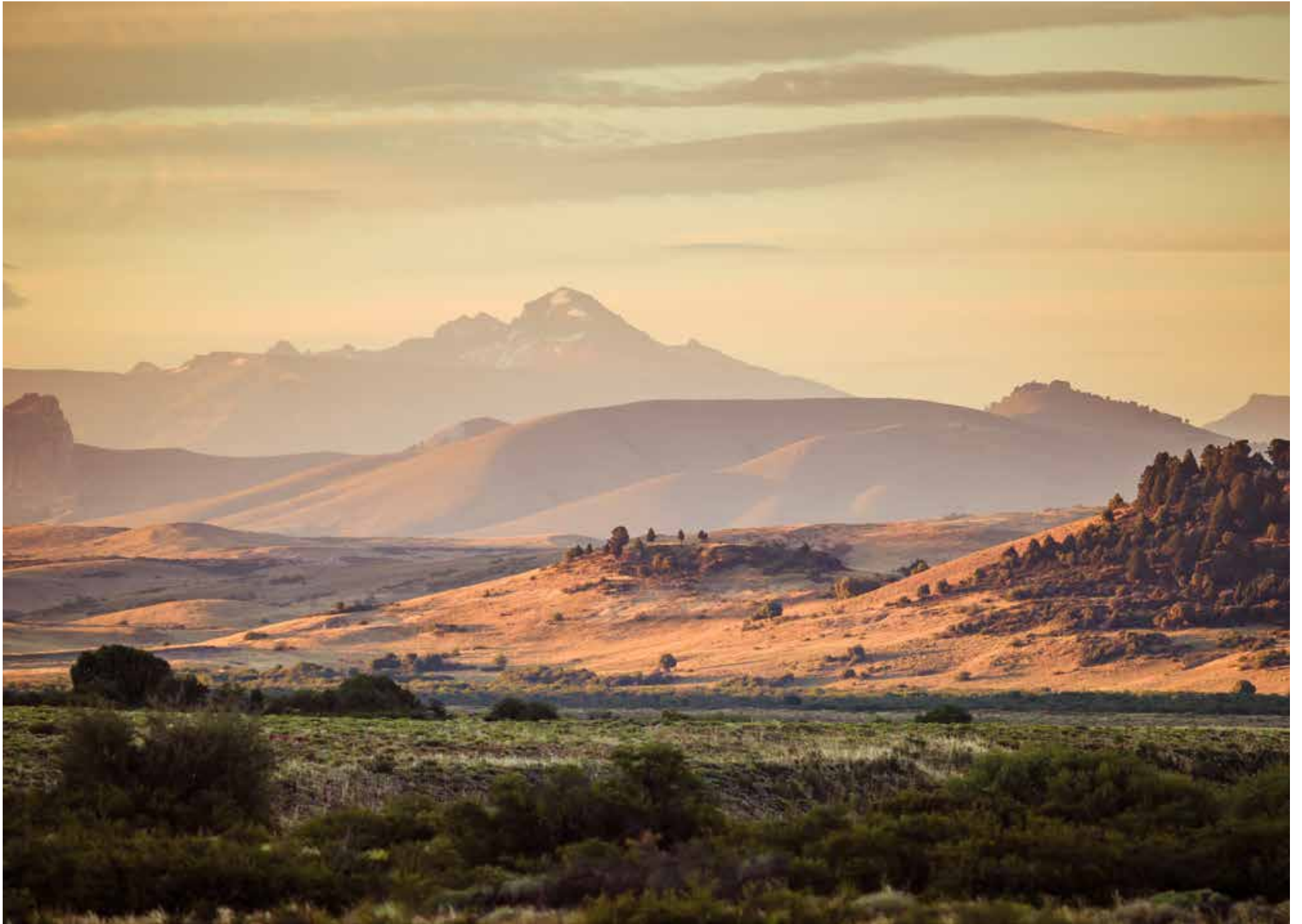
The landscape surrounding Chime Lodge: Chimehuín Valley, Junín de los Andes.