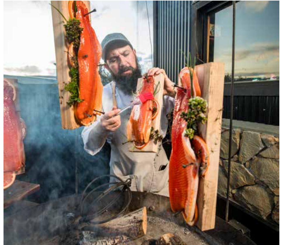
Wood roasted Patagonian trout hung over the fire.