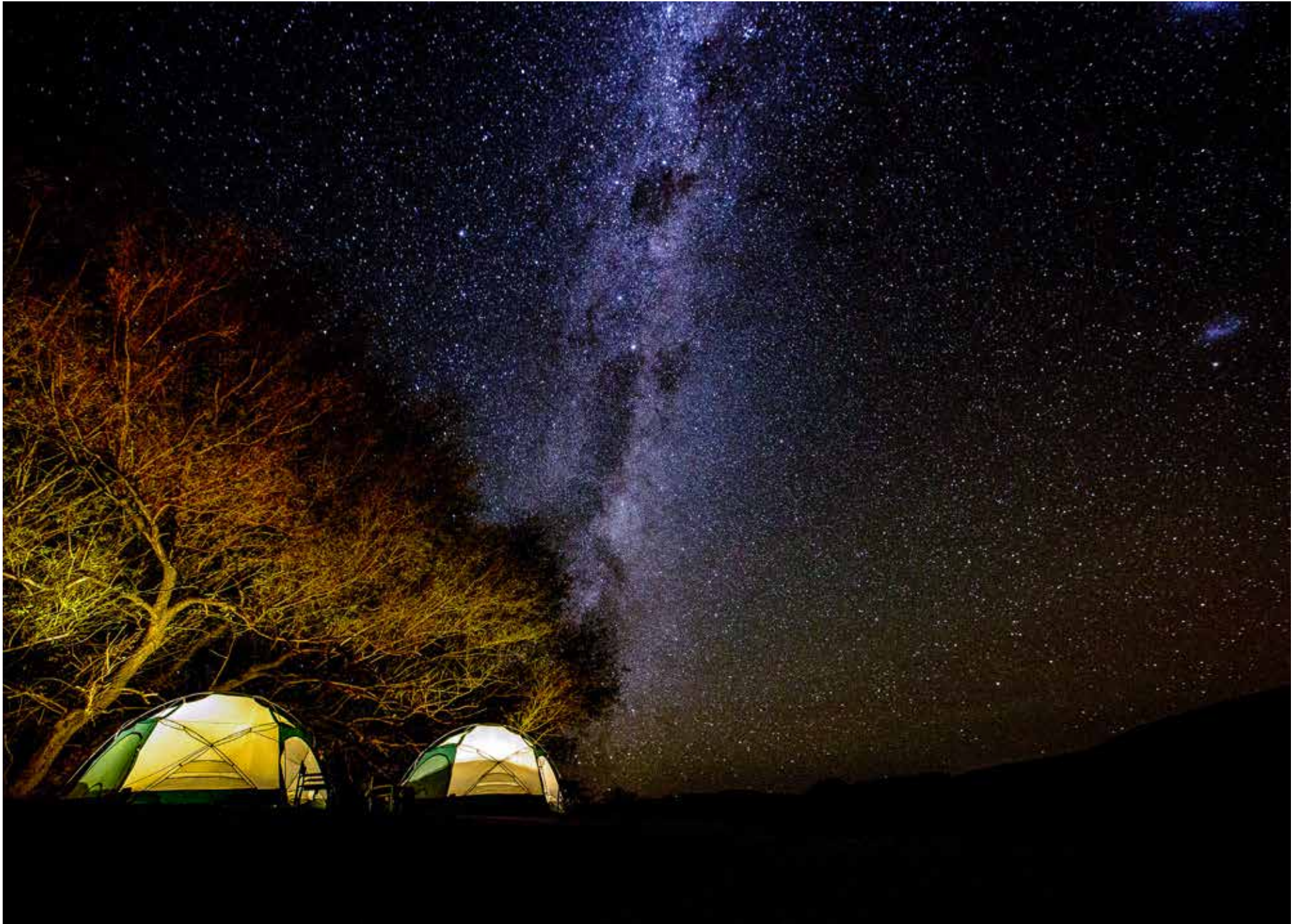
Discover breathtaking views of the night sky found nowhere else.