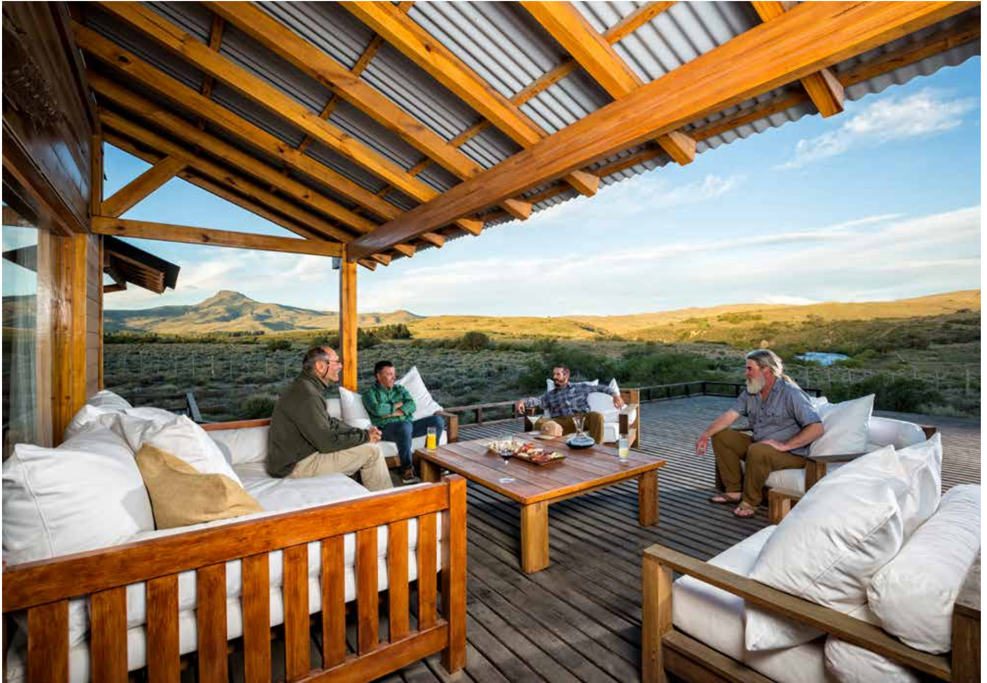
Enjoy a nice cocktail and appetizers on the deck, with matchless views of the Chimehuín River and the surrounding landscape.